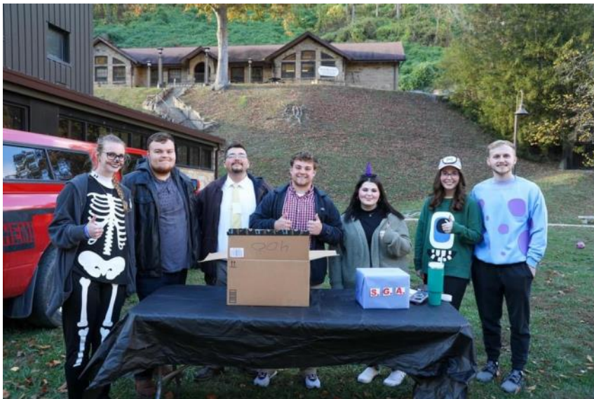
SGA Officers at Trick or Treat