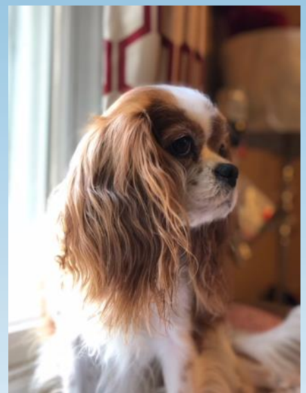
Zuzu is sad and waiting for family to return.

There is a clerk at the butcher shop, he is five feet ten inches tall, and he wears size 13 sneakers. What does he weigh?