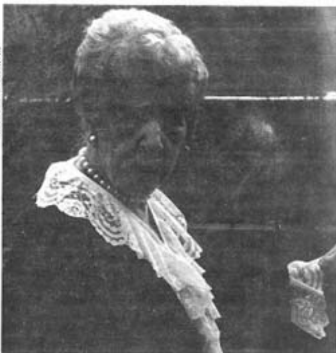
ALICE LLOYD ARCHIVES

Picture a college that takes no federal or state aid, where Kentucky mountain students from seven counties attend free of charge, where dormitory students do not cohabit, where there are rules and codes and moral standards, where